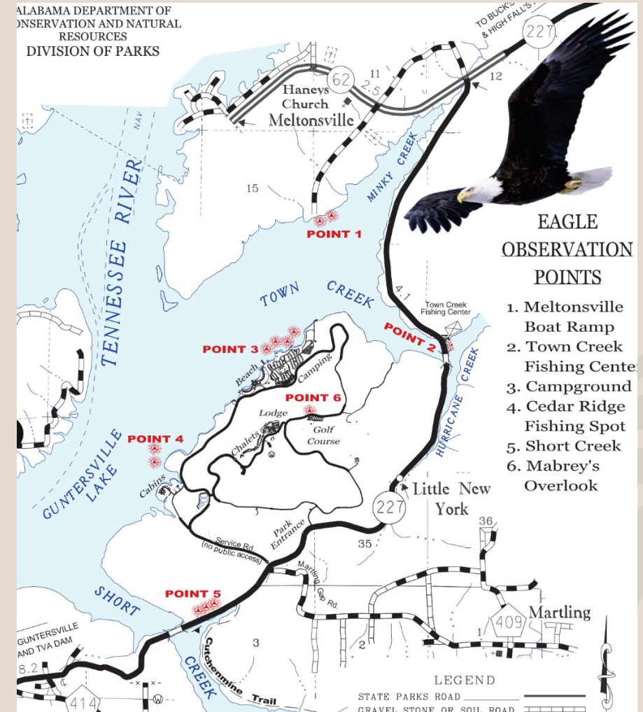
Guntersville Eagle Map

Several prime spots for eagle observation, especially during the winter months when bald eagles are most active. These points provide stunning views of the park's natural habitats, where eagles can be seen soaring, hunting, and nesting.